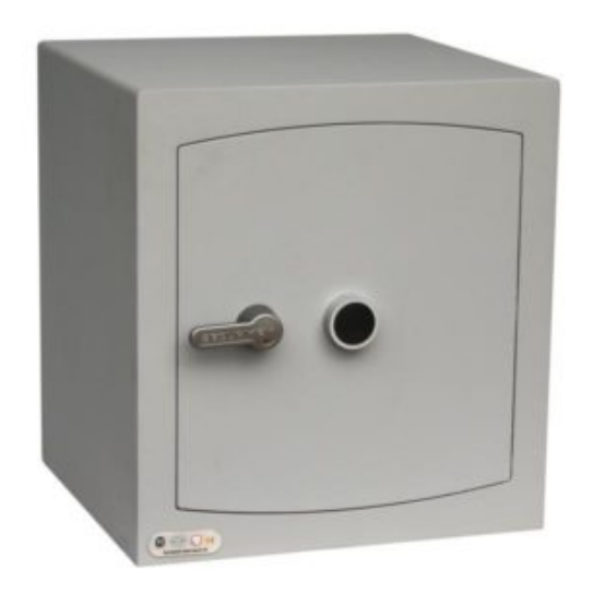
Mini Vault 3 S2 Gold FR Key Locking