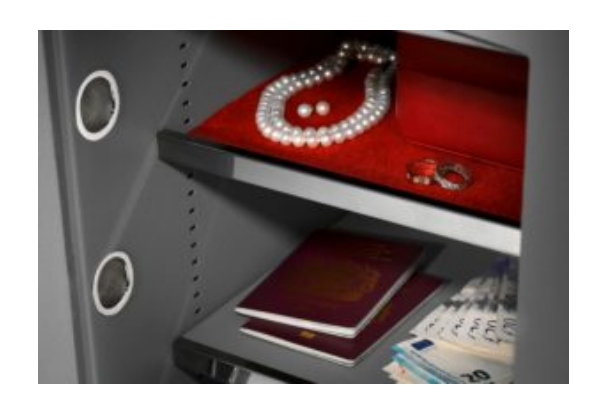
Mini Vault Jewellery Shelf