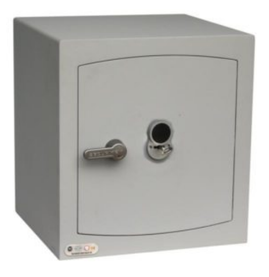
Mini Vault 3 S2 Gold FR Key Locking