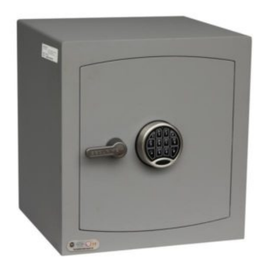
Mini Vault 3 S2 Gold FR Electronic Locking