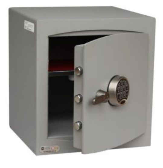
Mini Vault 3 S2 Gold FR Electronic Locking