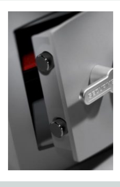
Mini Vault Bolts & Handle