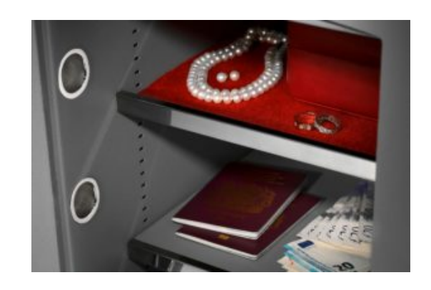
Mini Vault Jewellery Shelf