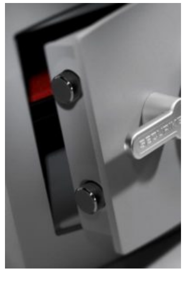
Mini Vault Handle and Boltwork