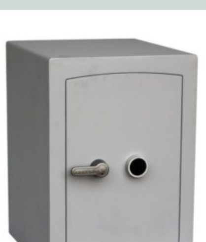
Mini Vault 2 S2 Silver Key Locking