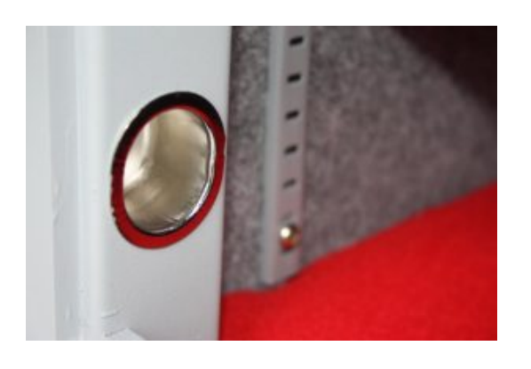
Mini Vault Chrome Bolt Cup