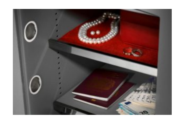
Mini Vault Jewellery Shelf