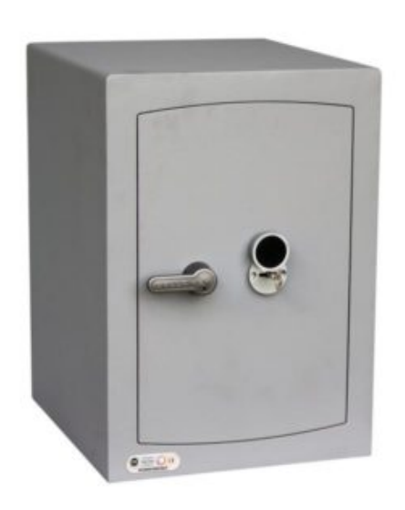
Mini Vault 2 S2 Silver Key Locking