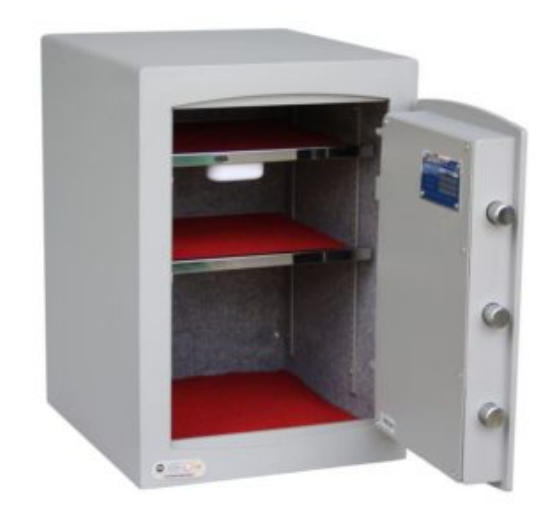
Mini Vault 2 S2 Silver Key Locking