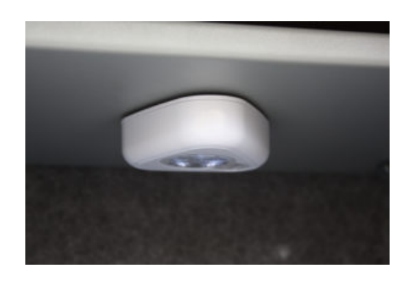
Motion Activated Magnetic Light