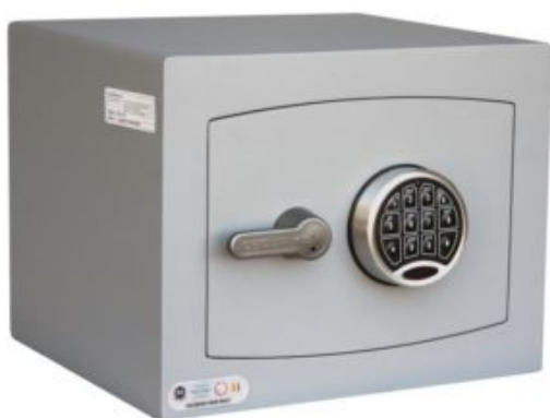
Mini Vault 1 S2 Silver Electronic Locking