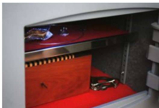
Mini Vault Jewellery Shelf