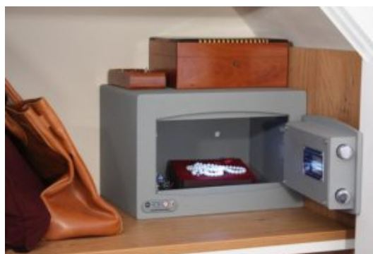
Mini Vault 0 S2