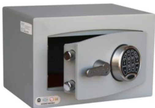
Mini Vault 0 S2 Silver Electronic Locking