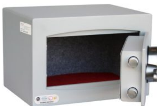
Mini Vault 0 S2 Silver Electronic Locking