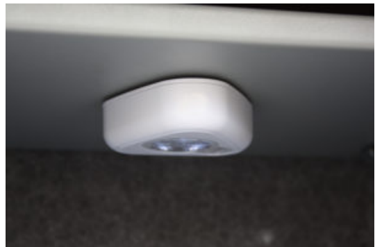
Motion Activated Magnetic Light