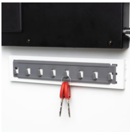
Ammunition cabinet 200D hookbar