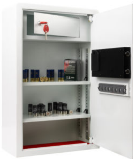
Ammunition cabinet 200D open